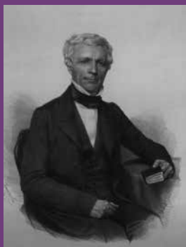
JOHANN HINRICH WICHERN